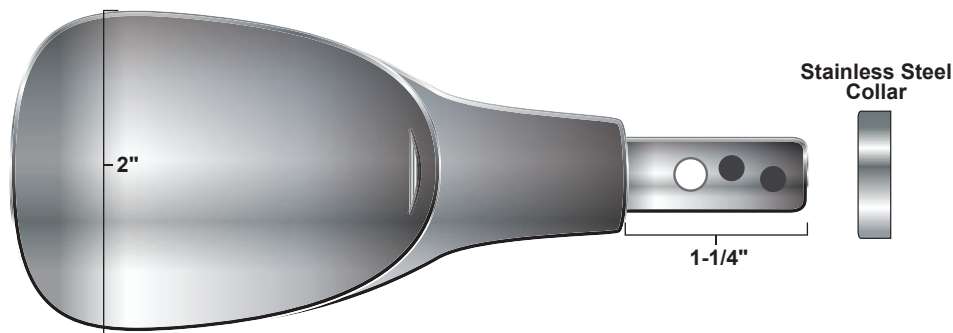
Diagram A - Parts and Assembly